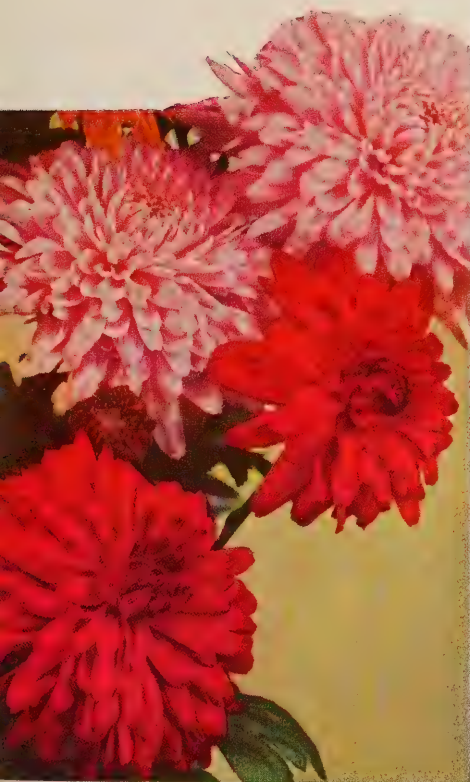
JEWELTONE (Pink) JUBILEE (Red) 75c each; 3 for $2.00